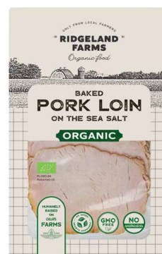
Baked pork loin on the sea salt