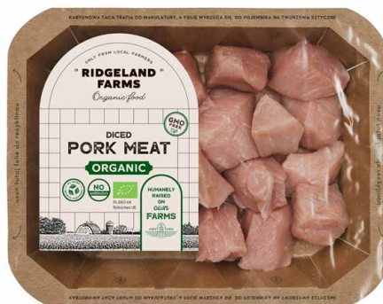
Diced pork meat