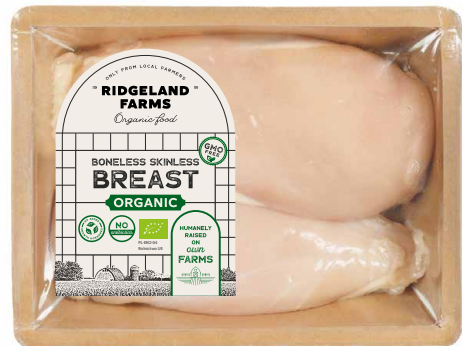
Boneless skinless breast