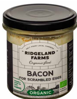
Bacon for scrambled eggs