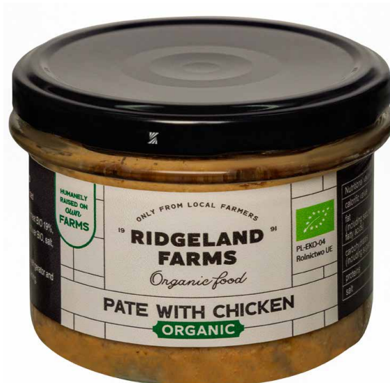
Free range chicken pate