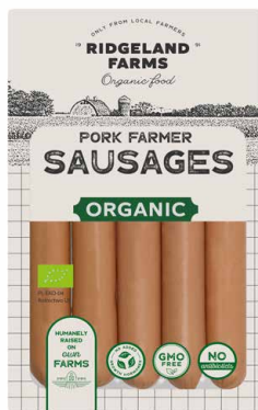
Pork farmer sausages