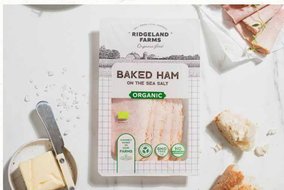
Baked ham on the sea salt