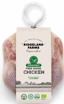
Whole organic chicken