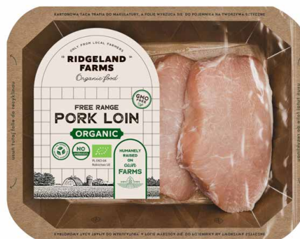
Free range pork loin