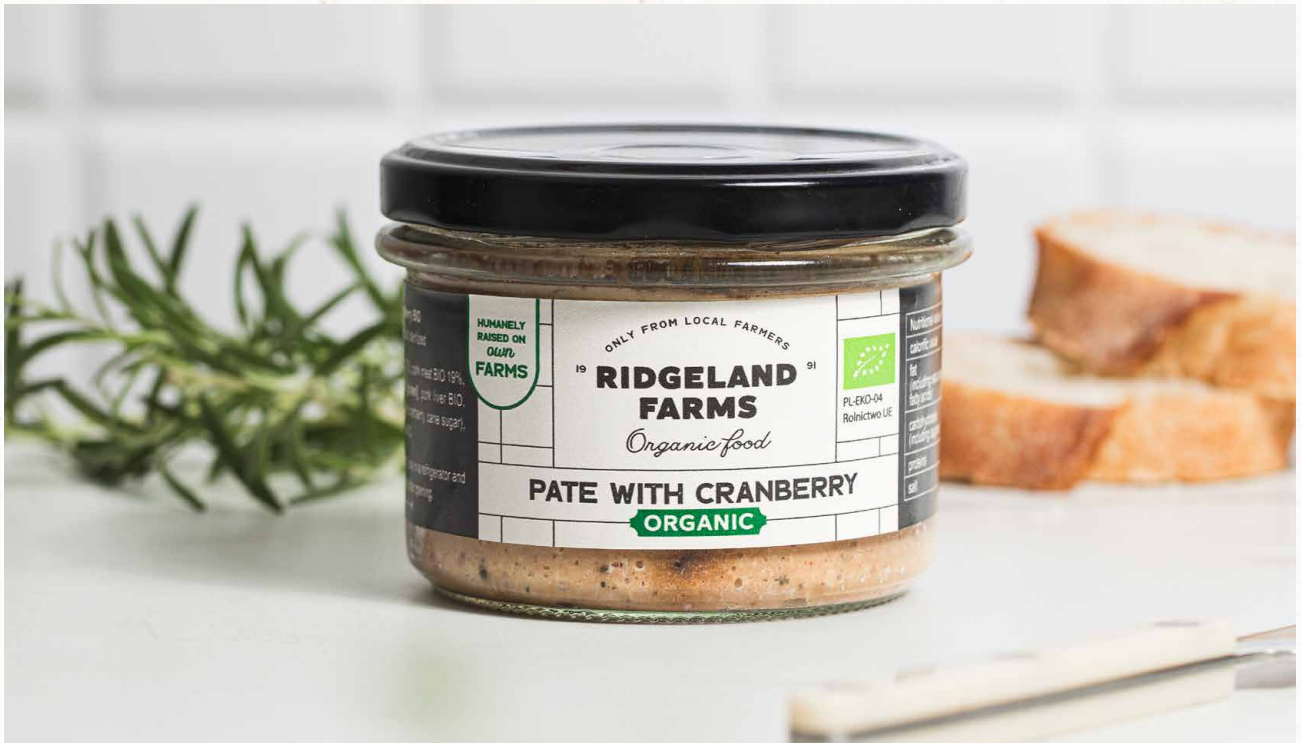
Pork pate with cranberries