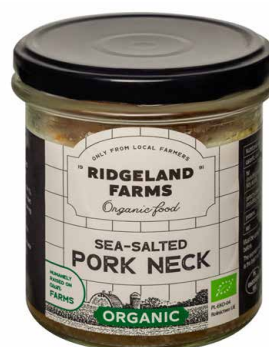
Pork neck on the sea salt