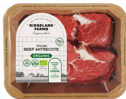
Polish beef antrecote