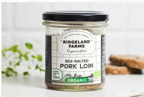
Pork loin on the sea salt