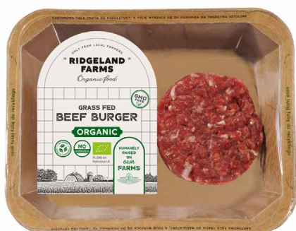
Grass fed beef burger